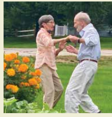
"From the moment I walked through the door, this has felt like home. Everyone is so friendly and welcoming; it's like a big family. I feel like I'm exactly where I'm supposed to be."