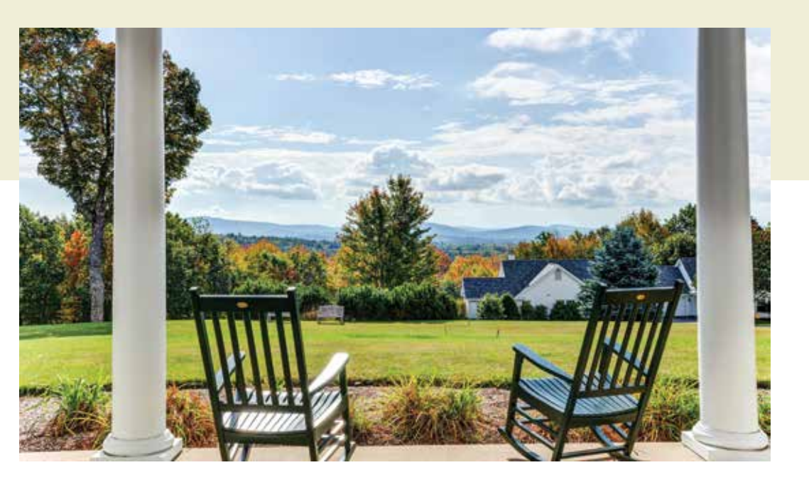
SUGAR HILL RETIREMENT COMMUNITY

A longtime dream was realized this year with the opening of the Woodside Pavilion, a delightful new outdoor community space. The covered pavilion features a fireplace, grilling facilities, and a convenient bathroom facility; a walking track, bocce court, putting green, shuffleboard court, and raised garden beds. This project came to life thanks in large part to the generosity of Taylor residents who have chosen to remain anonymous.